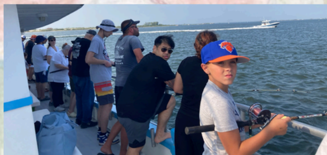
AFTERNOON AT SEA ON YANKEE III