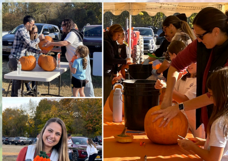
ANNUAL JACK-O-LANTERN BLAZE