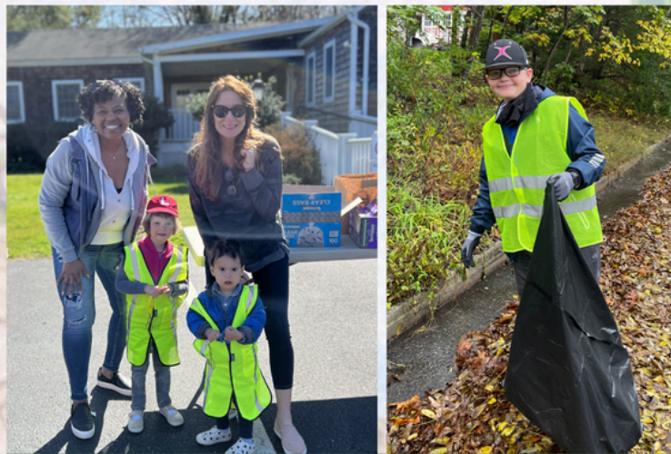
COMMUNITY CLEAN-UP AND DONATION DRIVE