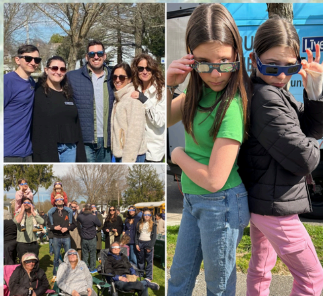
SOLAR ECLIPSE VIEWING PARTY