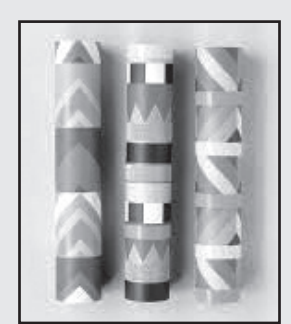
April 14 – Kaleidoscope