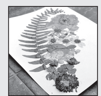
April 7 – Recycled Flower Art