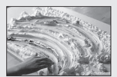
March 17 - Rainbow Art