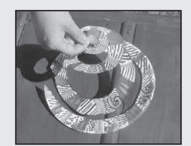
March 10 – Paper Plate Wind Twirler