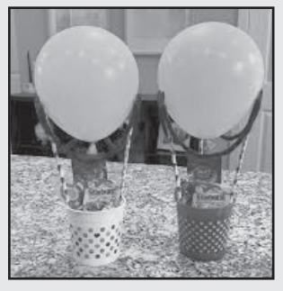
March 31 – Mini Hot Air Balloons